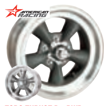
TORQ THRUST D - RWD 105D/605D Series (D = will clear disc brakes) Gray Painted Face w/Machined Lip (105), Chrome 14x6 15x10, 15x4.5, 15x6, 15x7, 15x8.5, 16x8