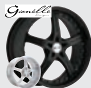
Spezia 5 Black 19x8.5, 19x9.5, 22x10.5