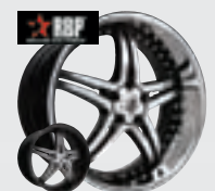
LX-15 LX Series Machined Black Chrome Lip Machined Black Black Lip 20x8.5, 22x10