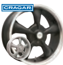
S/S - FWD/RWD 600 SERIES Black, Gray 15x7, 15x8, 16x7, 17x7