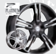
Saber - FWD/RWD/4WD 291-292 Series Gloss Black w/Diamond Cut, Chrome 16x7, 17x7.5, 18x8, 20x8