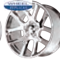
SRT10 - RWD 36 Series Chrome 20x9, 22x10