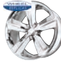
Challenger - FWD/RWD 1159 Series Chrome 20x9 Car (Muscle)