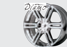
39 Karat - FWD D10392 Series Bright PVD Chrome Finish 18x8, 20x8.5, 22x9, 22x9.5