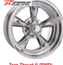
Torq Thrust II (RWD) 505 Series Polished 14x6, 16x7, 15x4, 15x6, 15x7, 15x8, 15x10, 16x7, 16x8, 17x7, 17x8, 17x9.5, 17x11