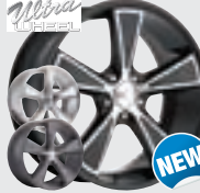
Hustler 431 Series Diamond Cut w/Black, Chrome, Gray 18x8, 18x9.5, 20x9, 20x10