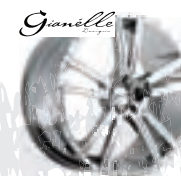
Venezia Chrome Machined Black 20x8.5