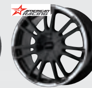
Speedway - FWD/RWD AR881 Series 1 Pc. Aluminum Painted Gloss Black 16x7, 17x7.5, 18x8