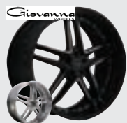
Essen Chrome, Machined Black 20x8.5