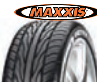
MA-Z4S Victra Z4S All Season High Performance Radial