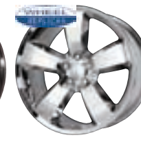
SRT 8 - FWD/RWD 1150 Series Chrome 20x9