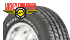
Sportsman® S/T Radial Raised Whites!