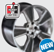
Hurst MUTL Series Shadow Chrome Polished w/Matte Gunmetal Grey Inserts 20x9 (Front), 20x10 (Rear)