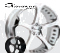
Dalar Chrome, Machined Black 20x8.5, 22x9