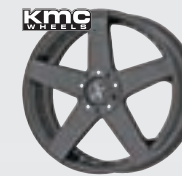
Rockstar Car (KM775) 775 Series Matte Black 18x8, 20x8, 20x10 (22x8.5 - S0)