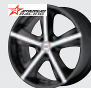
Phantom - FWD/RWD AR8827 Series Matte Black/Machined 17x7.5, 18x8, 20x8.5, 20x9