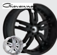
Sabina Black 19x8.5, 19x9.5, 20x8.5