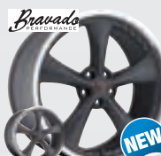
Americana II AR Series Matte Black/Machine Lip Graphite/ Machine Lip 18x9, 18x10, 20x9.5, 20x11, 22x9.5, 22x11