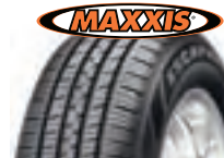
MA-T1 Escapade Premium Touring