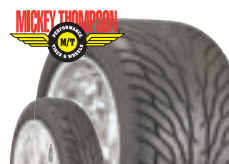
Sportsman® S/R Radial H-Rated