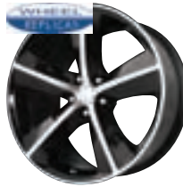
Challenger - FWD/RWD 1159 Series Black 20x9 Car (Muscle)